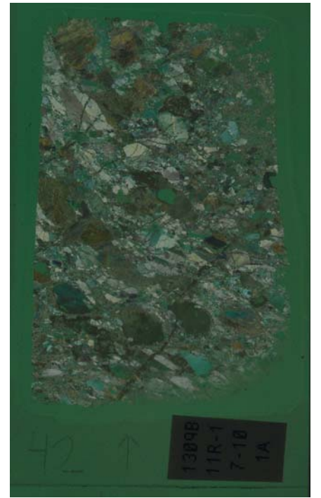
Thin section image XPL