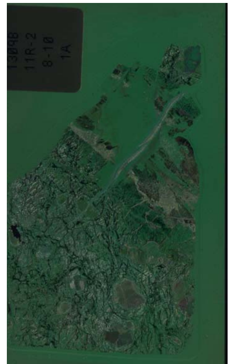
Thin section image XPL