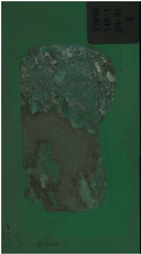
Thin section image XPL

Photomicrographs and additional comments: