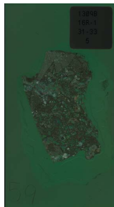
Thin section image XPL