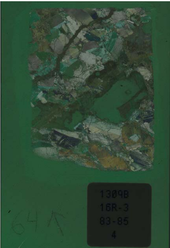
Thin section image XPL

Photomicrographs and additional comments: