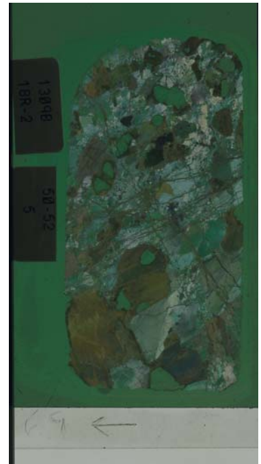
Thin section image XPL