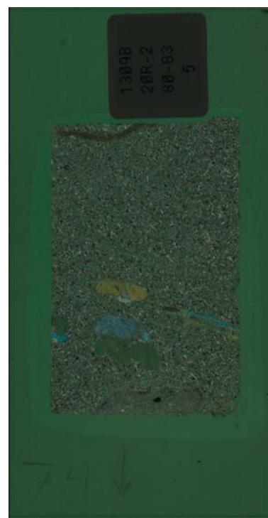
Thin section image XPL