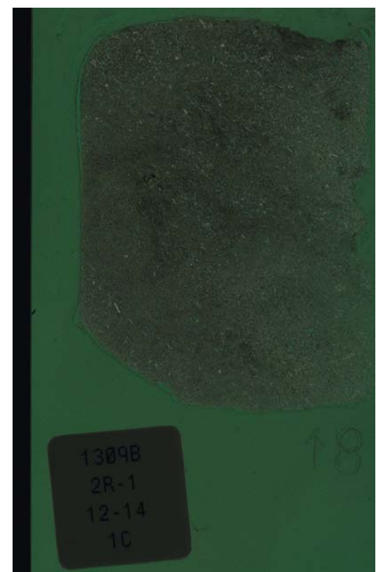
Thin section image XPL