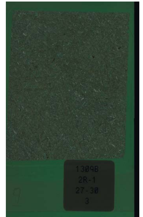
Thin section image XPL