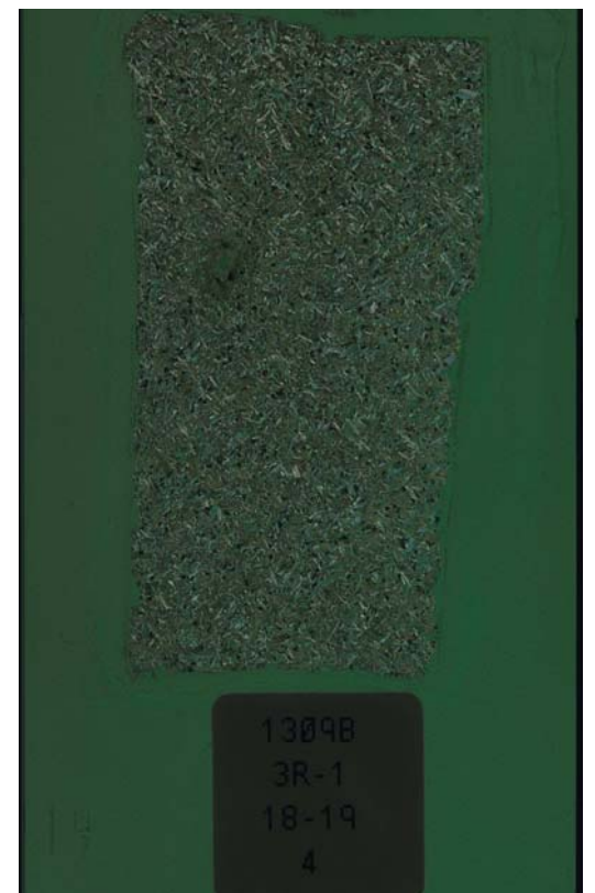
Thin section image XPL