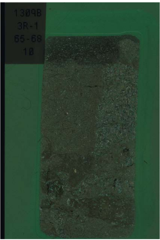
Thin section image XPL

Photomicrographs and additional comments: