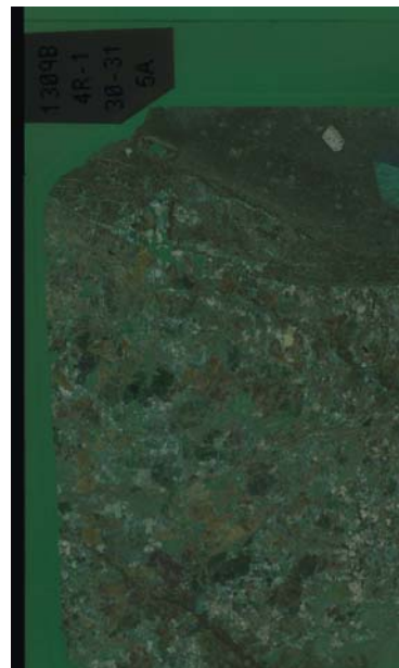
Thin section image XPL