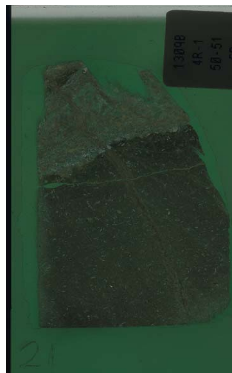
Thin section image XPL

Photomicrographs and additional comments: