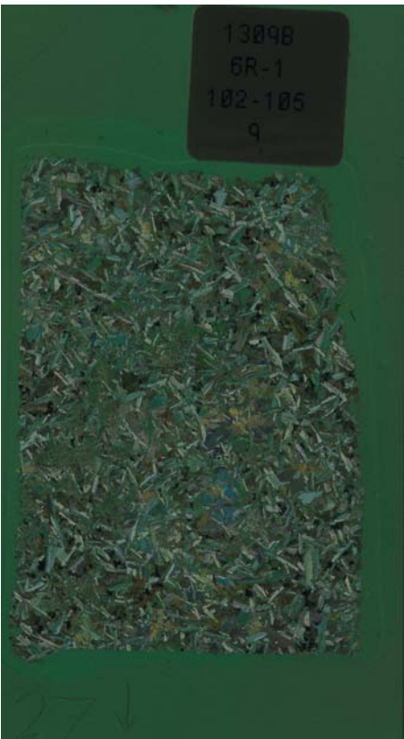
Thin section image XPL