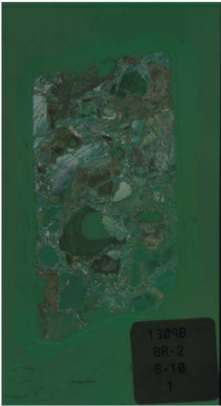
Thin section image XPL

Photomicrographs and additional comments: