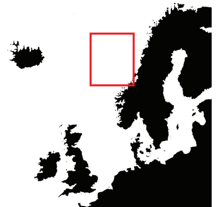
IODP Expedition 396 Site Map