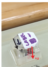
Position 1 ("Top-right")